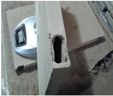
image 2 Ceramic plate with increased cavity

construction has been recommended. This led to research and development of new technological solutions ending up with design and production technology of ceramic plates with 66,66 % cavity (image 2). Apart from lightening the construction, the new single plates provide better isolation within the box because of the airbags (the inner part of the plate is filled with air) which ensures better living conditions and optimal temperature, significantly reducing the work of the bees in providing better living conditions.