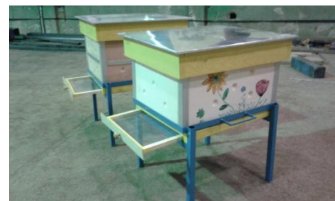
image 3 Ceramic beehives, improved experimental model

Following the recommended modifications, 14 beehives have been produced and put in natural conditions with bees inhabited in apiaries in different geographical regions. The beekeepers who participated in the experiment were asked to observe the bees' behavior and to report problems and impressions they have from the exploitation of the experimental model. From all the beekeepers feedback has been collected. During the experiment, in summer periods in two of the apiaries occurred fire. In both places the only remaining hive from the burning beehives is the experimental ceramic one. The last report on the results of the usage of the ceramic beehive is from the autumn of 2018 when the beekeepers report 30% increase in the honey production in comparison with the production in the wooden hives. For none of the ceramic hives is reported bee loss or CDD.